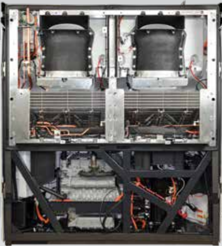
Rear view without back panel.